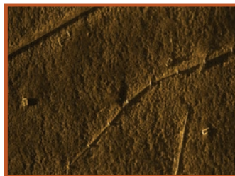
2D SAS Imagery