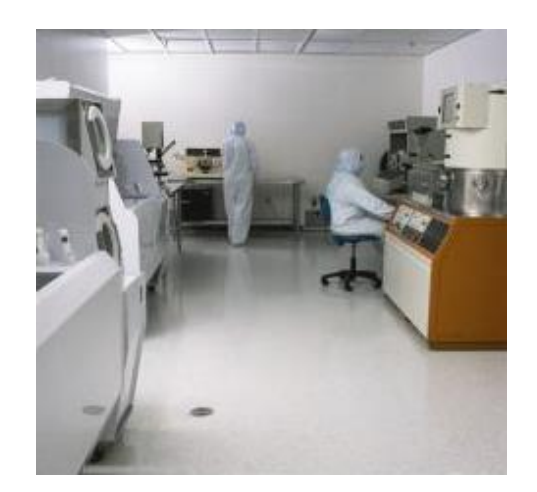
Figure 3. Wafer Processing is completed inside of a class 100 clean room at CEO.

The above process steps are all completed on an epitaxial wafer which typically has a thickness of approximately 625 microns. It is -desirable for the final device thickness to be considerably less than this. Minimizing the thickness of the device allows electrical series and thermal resistances to be reduced and also allows devices to be vertically stacked with reduced device to device spacing, or 'pitch'. The wafers are thinned to the desired device thickness by lapping and chemical-mechanical polishing (CMP). The wafer is first mechanically lapped using an abrasive water and ceramic slurry. The lapping process results in microscopic damage to the surface. This damage is then removed and the wafer is thinned to its final thickness by chemical mechanical polishing. The wafer is typically thinned to a final thickness (typically 100-200 microns) during the lap and polish process. The n-side is then metallized by sputtering layers of gold, germanium, and nickel on the n-side, then completing a rapid, high-temperature thermal cycle to intermix, or alloy, these layers with the semiconductor, resulting in an ohmic contact with very low contact resistivity. Additional metal layers may be sputtered or plated over the n-side ohmic contact as necessary to provide a suitable interface for soldering or wire bonding.