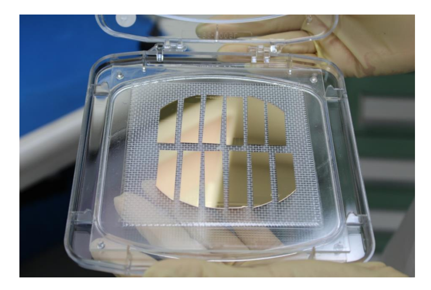
Figure 4. A wafer is shown cleaved into columns. This wafer will later be cleaved into rows forming individual diode bars.