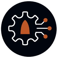
Warhead Digital Optimizer