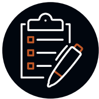
Arena and Sled Testing