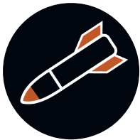
Lethality Enhanced Ordnance (LEO)

Northrop Grumman tackles each set of fuze and payload mission requirements as a standalone project to design and develop a completely tailored solution to match the mission.