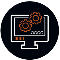
Model Based Systems Engineering