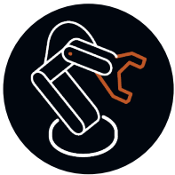
Advanced Production Facilities