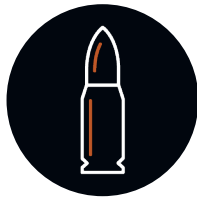
Insensitive Munitions Compliance