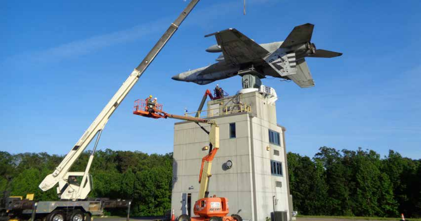
▶ Northrop Grumman's Next Generation Jammer-Low Band demonstration unit for the EA-18G Growler successfully underwent testing at the U.S. Navy's Facility for Antenna and RCS Measurement and Air Combat Environmental Test and Evaluation Facility.