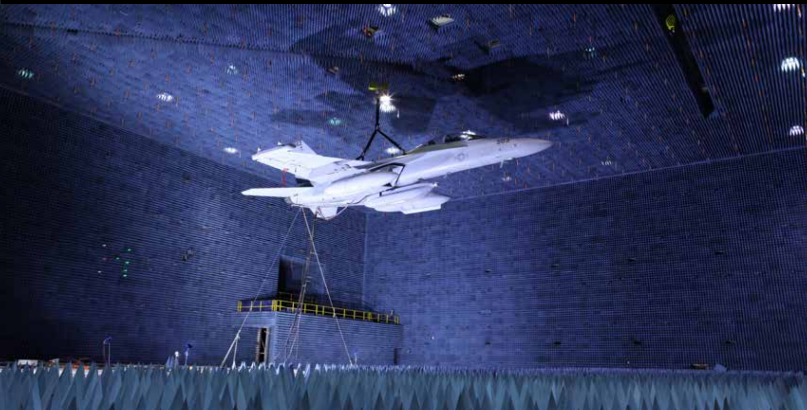
▶ Northrop Grumman's Next Generation Jammer-Low Band Demonstration of Existing Technologies demonstration unit undergoes testing inside the Naval Air Systems Command Air Combat Environment Test and Evaluation Facility's (ACETEF) anechoic chamber.

Northrop Grumman is proposing digital and model-based engineering for both Next Generation Jammer-Low Band and