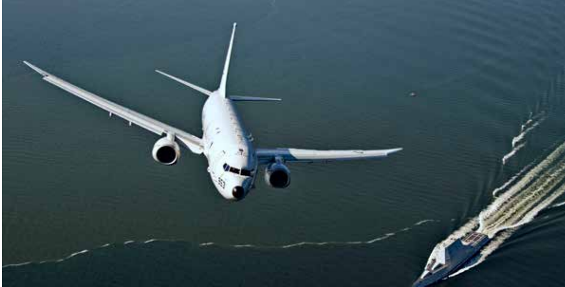
▶ A P-8A Poseidon flies over the Chesapeake Bay above the USS Zumwalt (DDG-1000) guided-missile destroyer.

The company’s team in Bethpage, New York is leading efforts for Naval electronic warfare work, including housing a state-of-the-art electronic attack system integration lab for complete system testing.