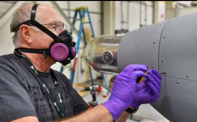
▶ Northrop Grumman's Bethpage, New York employees continue to work on next-generation systems to support the naval aviation community that they have served for decades. That work continued even through the recent coronavirus pandemic.

Northrop Grumman's position as the AEA integrator for the Navy's Growlers is a strong foundation for providing critical capabilities for the Growler's Block II upgrade program and electronic attack pod upgrades under the Next Generation Jammer programs.