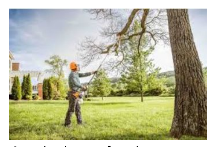
Sample photos of work